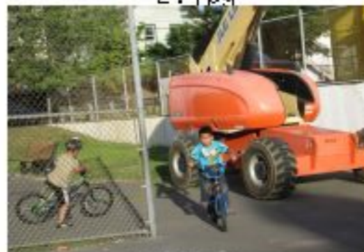
ps 5 One of things just doesnt belong.jpg