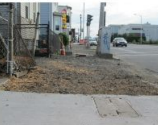
RR 5A Step on a Crack 1.jpg