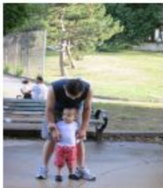
cc 8 Like Father Like Son.jpg