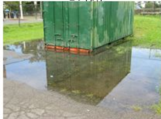
P 8A Rain Rain 1.jpg