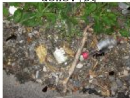
P 5 Beautification way 2.jpg