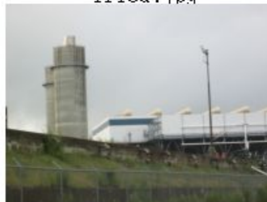
P 2Smokeless stacks 1.jpg