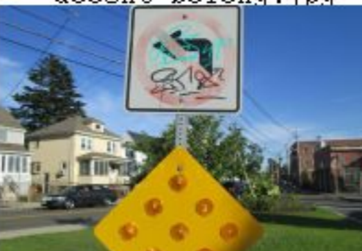
RR 2 Sign me Up 2.jpg