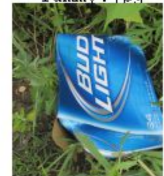
DA 3 Hide and Go Drink 2.jpg