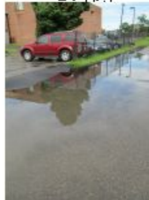
P 8B rain 2.jpg