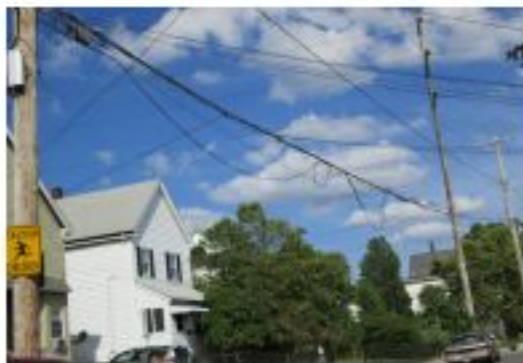
ps 1 Dont Get Tangled Up.jpg