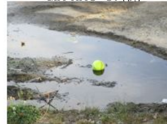
P 9 rain 3.jpg