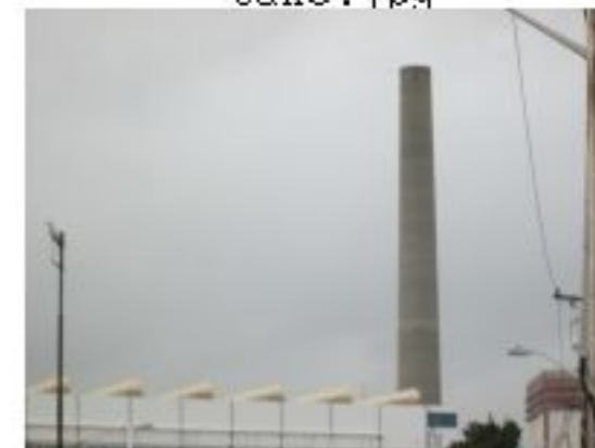
P 3 smokless stacks 2.jpg