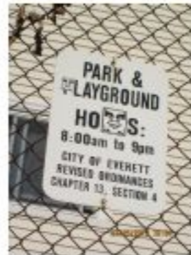
gr 3 At Least We Tried.jpg