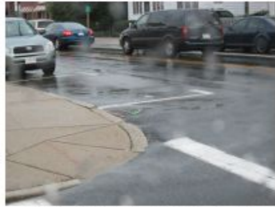
RR 6 Blind Side 1.jpg