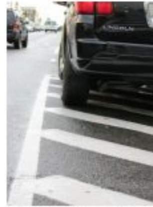
RR 7Blind Side 2.jpg