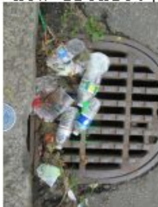
P 7 One thing leads to another 2.jpg