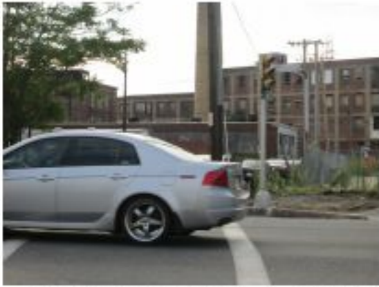
RR 5D Step on a crack 4.jpg