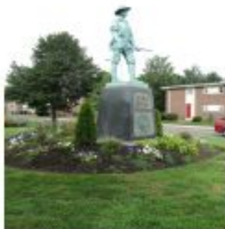
cc 4 The Hiker.jpg