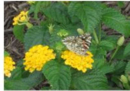
cc 2 Butterfly Effect.jpg