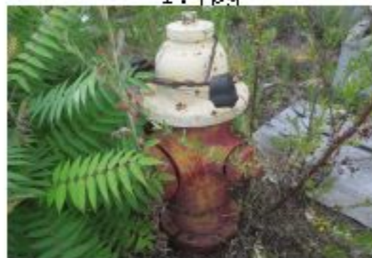
PS 4b Where's the Fire Hydrant.jpg