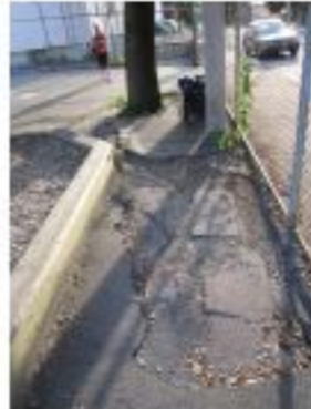
un 3 Not all it's cracked up to be.jpg