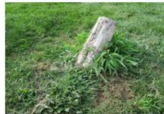
ps 3 Stumped.jpg