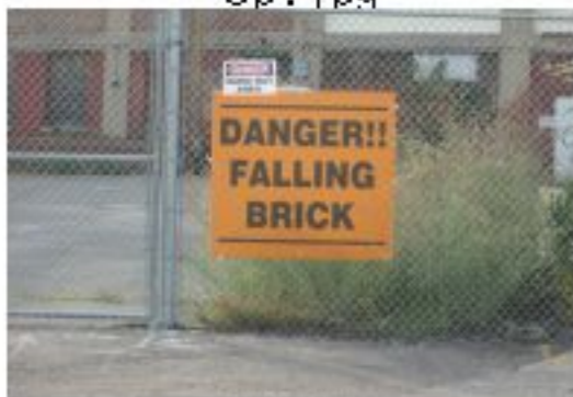
ps 4A Watch Out Below.jpg