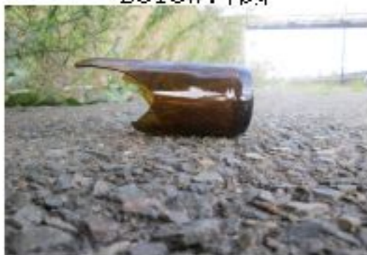
ps 7 Genie in a Bottle.jpg