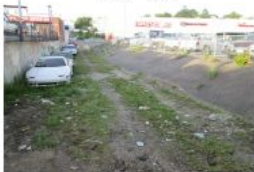
P 4 beautification wsay , how ironic.jpg