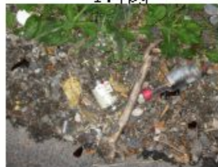
P 5 Beautification way 2.jpg