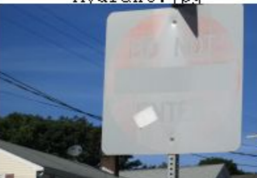
RR 1 Sign Me up 1.jpg