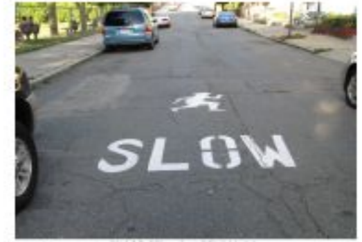
RR 8 Behind a rolling ball.jpg