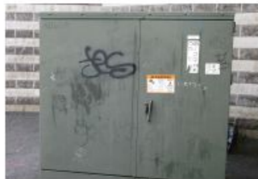
PS 2B Electric Slide 2.jpg