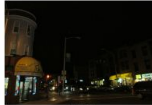
SAN3 Lights Out.jpg