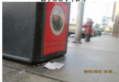
P 1 Has enough been done.jpg