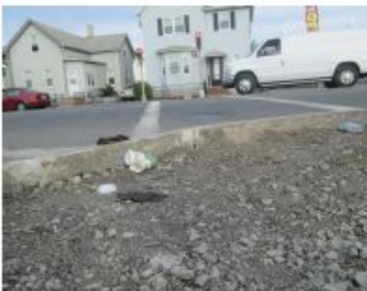
RR 5C Step on a Crack 3.jpg