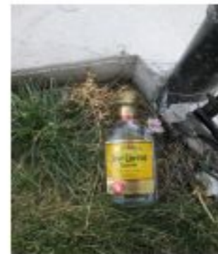
DA 2 Hide and Go Drink 1.jpg