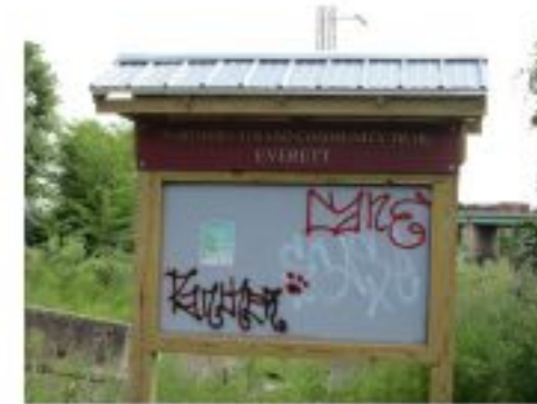
gr 4 How long does it take.jpg