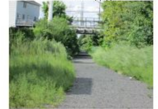
un 1 Broken Road.jpg