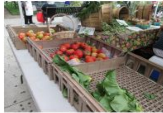
cc 1 Apple of my Eye.jpg