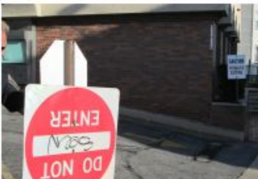
RR 3 Sign me up 3.jpg