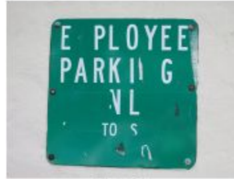
un 4 Read Bewtween the Lines.jpg