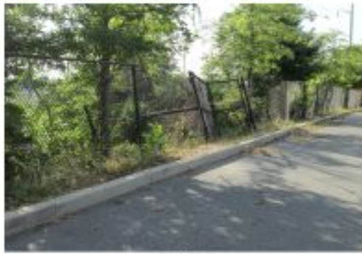
Br 1 Twisted.jpg