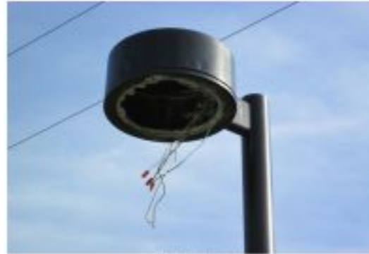
SAN 2 Lights Out.jpg