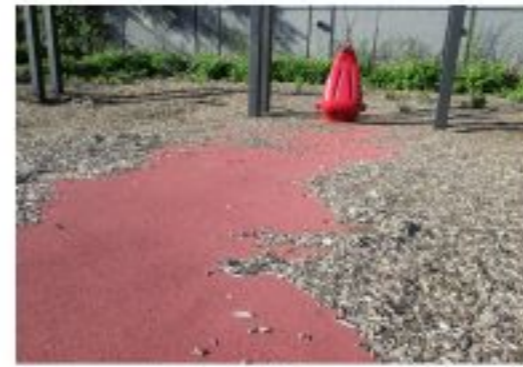
Br 3 Jungle Junk.jpg