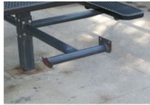
Br 2 Take a Seat.jpg