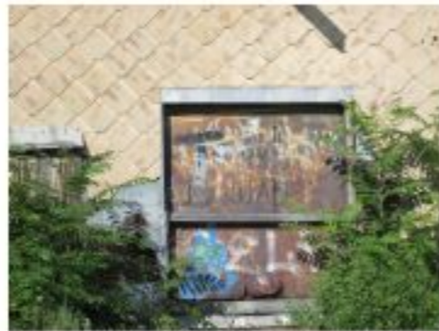
gr 2 Sight for Sore Eyes.jpg