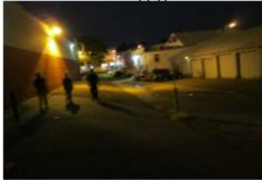
SAN 1Lurking in the Shadows.jpg