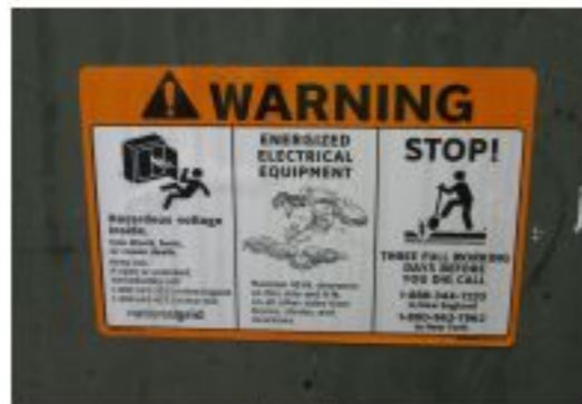
ps 2A Electric Slide 1.jpg