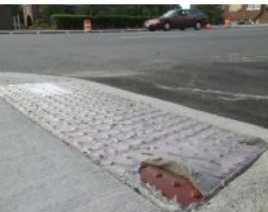
RR 5B Step on a Crack 2.jpg