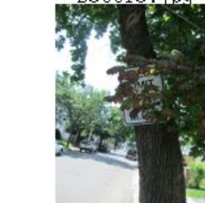
RR 4 Sign me up 4.jpg