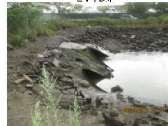
P 6 one thing leads to another 1.jpg