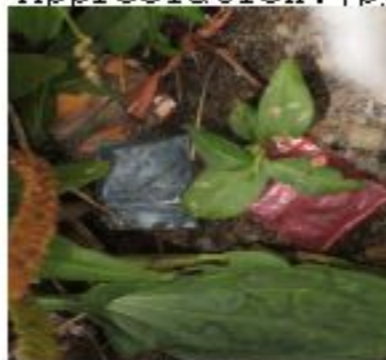
DA 1 High Nice to meet you.jpg