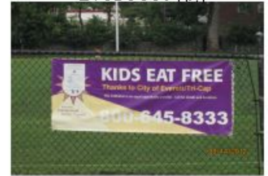
cc 7 Yummy in my Tummy.jpg