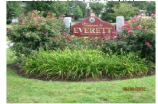
cc 3 Welcome to Everett.jpg