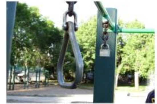
br 4 Just Trying To Hang Around.jpg