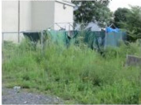
un 2 The Grass is Greener on the Other Side.jpg