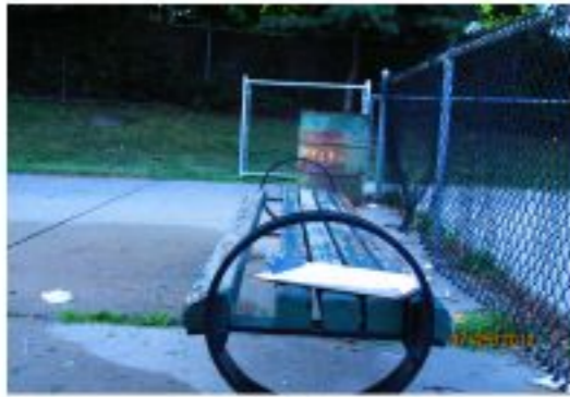
br 5 Bench Warmer.jpg