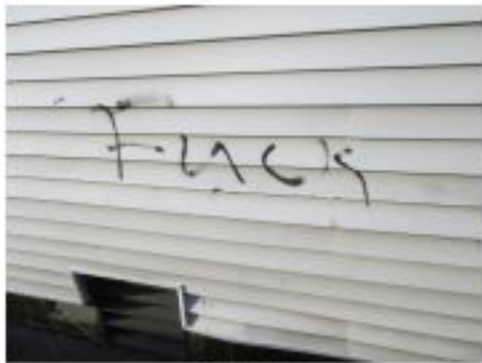
gr 1 Watch your Mouth.jpg