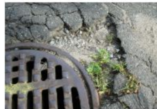
ps 6 Rough Patch.jpg