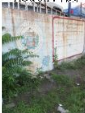
gr 5 Good Project Gone Bad.jpg