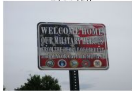
cc 5 Showing our Appreciation.jpg